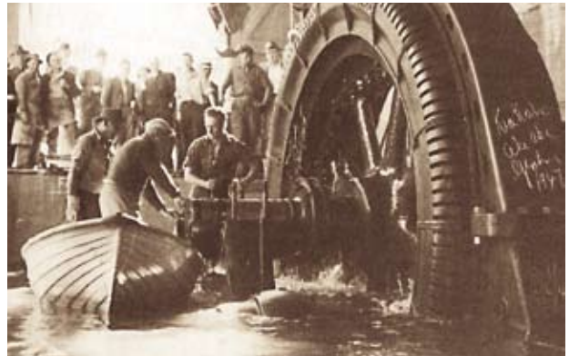
Horahora power station being flooded as villagers watch on, 1947